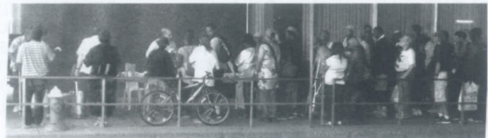
“Is it not to share your food with the hungry and to provide the poor wanderer with shelter...?” ~Isaiah 58:7

Total Clients Served: 1,118 Homeless: 464 Male: 805 Female: 273 Seniors: 56 Children: 40 Total Volunteer Hours: 152