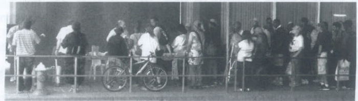
“Is it not to share your food with the hungry and to provide the poor wanderer with shelter...?” ~Isaiah 58:7

Total Clients Served: 1,041 Homeless: 393 Male: 827 Female: 185 Seniors: 98 Children: 29 Total Volunteer Hours: 110