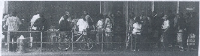
"Is it not to share your food with the hungry and to provide the poor wanderer with shelter...?" ~Isaiah 58:7

Total Clients Served: 949 Homeless: 451 Male: 700 Female: 185 Seniors: 42 Children: 22 Total Volunteer Hours: 140