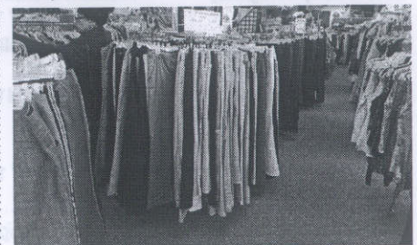
Thrift Shop's new carpeting gave us a fresh, clean appearance and happy customers.

Our customers are thrilled; and, we thank God for this goodness and for our fresh new look. Thank you to our donors who make all this possible.