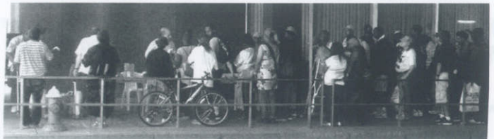
"Is it not to share your food with the hungry and to provide the poor wanderer with shelter...?" ~Isaiah 58:7

Total Clients Served: 851 Homeless: 332 Male: 740 Female: 103 Children: 8 Total Volunteer Hours: 140