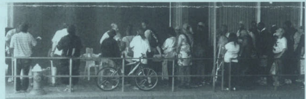
"Is it not to share your food with the hungry and to provide the poor wanderer with shelter...?" ~Isaiah 58:7

Total Clients Served: 900 *Plus several hundred attended annual Christmas Eve dinner (not listed in these #s) Homeless: 488 Male: 800 Female: 89 Children: 11 Total Volunteer Hours: 250+